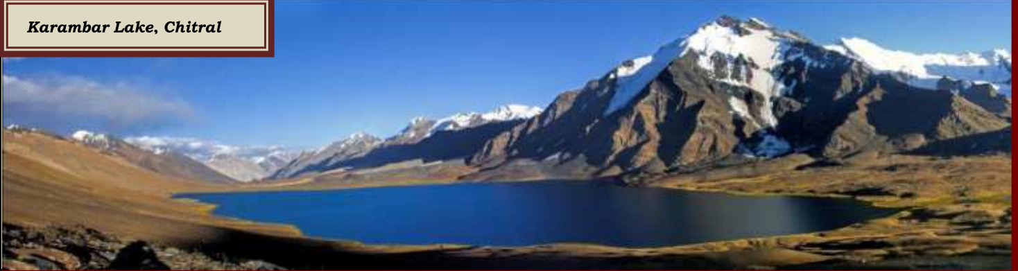
Karambar Lake, Chitral