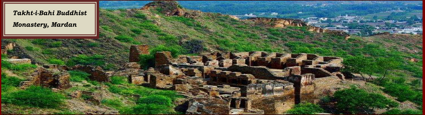
Takht-i-Bahi Buddhist Monastery, Mardan